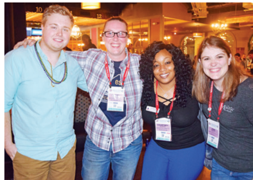
Rental operators from across the United States and Canada took advantage of the networking opportunities that were offered at the Young Professionals Conference in November 2017 and the Young Professionals Network (YPN) Reception during the Show this past February.